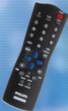
29-Button Total Remote (Remote# RCL9UB/04)