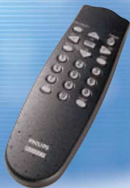
21-Button Total Remote (Remote # RCO702/04)