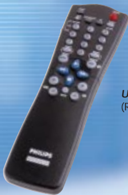
Universal TV/VCR/Cable Remote (Remote # RCU82C)