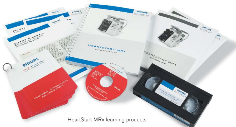
HeartStart MRx learning products