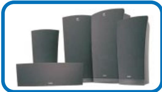
* Recommended speaker package : Philips FB755