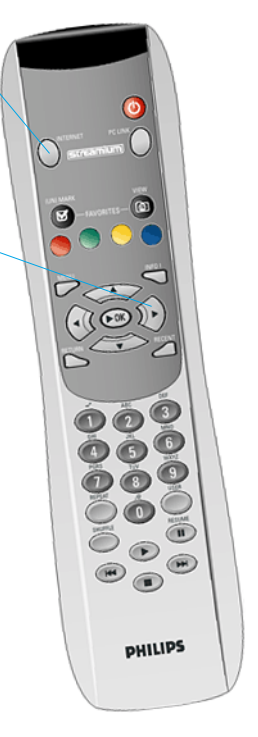
The Streamium SL300i/SL400i remote

Games section below for more details about available moves online. The following pages provide instructions on using your My.Philips account to bring music, pictures, videos and games from the Internet to your Streamium. Visit <a href="http://philips.com/streamium">http://philips.com/streamium</a> for more assistance,