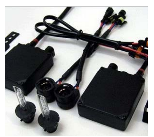
NBO system uses true factory style bulbs D2S.