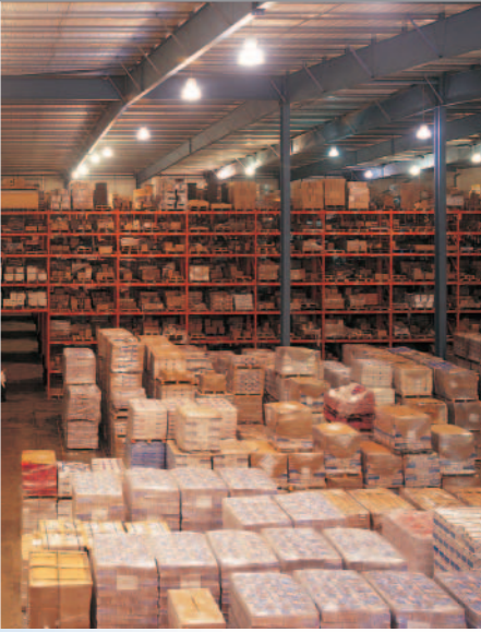
Ideal for roadway lighting, warehouse lighting, security lighting, and industrial applications