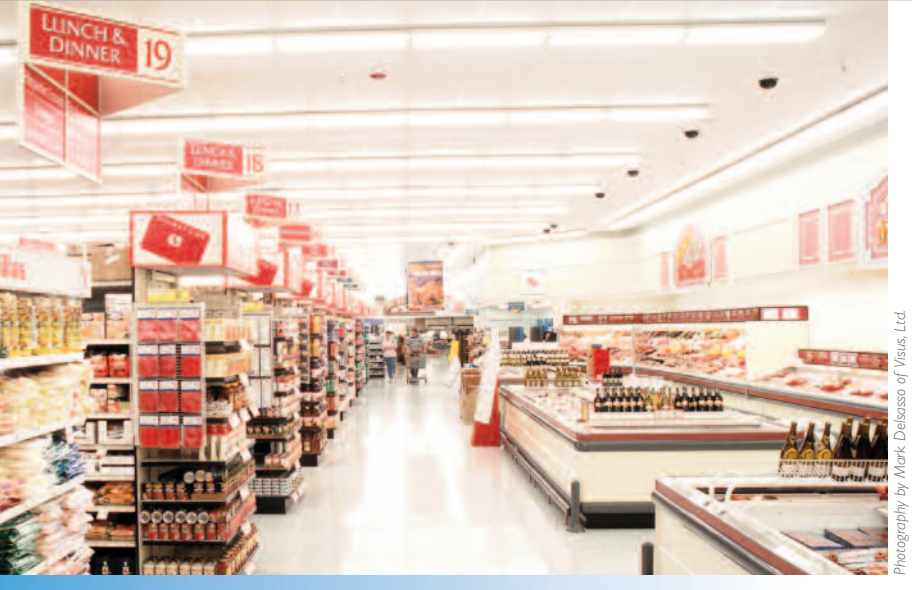
Ideal for applications where longer relamp cycles would be beneficial

Environmentally Responsible Lamps: Long Life and Low Mercury