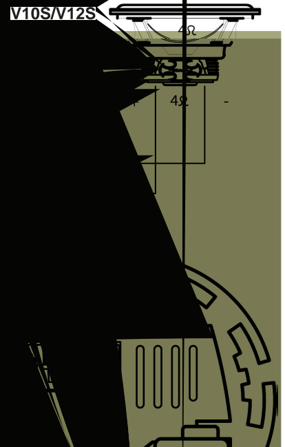
FIG 2. 2 OHM, 2x V10S/V12S