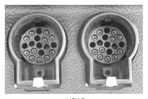
HEAD CONNECTOR TOP VIEW

The light head connectors are key-shaped, snap-in type and will only attach correctly. The plugs must be inserted until the locking snap is heard. Press the flat metal inset to release. The mating pins are automatically lubricated during each insertion and withdrawal to greatly extend the life of these connectors.