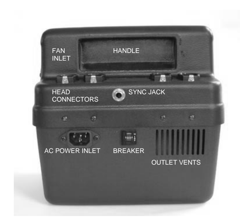
REAR VIEW OF PHOTOMASTER