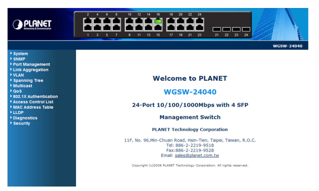
Figure 6-3 Web Main Screen of WGSW / SGSW Managed Switch

The following screen based on WGSW-24040 for SGSW-24040 the display will be the same for WGSW-24040.