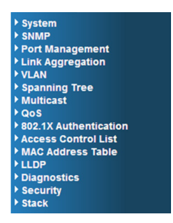
Figure 6-4 Switch Menu

4. The Switch Menu on the left of the Web page let you access all the commands and statistics the Switch provides.