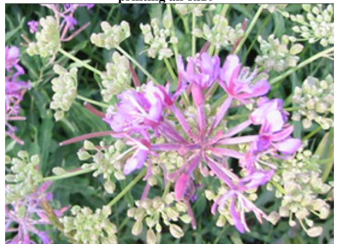
100 pixels per inch, same as a 1 megapixel camera printing an 8x10