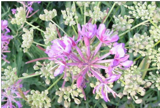
300 pixels per inch, same as a 6 megapixel camera printing an 8x10

In the following example, I have reproduced several images on the page in resolutions that represent the resolution produced by cameras printing an 8x10" print in 6, 4, 2 and 1 megapixel resolution.