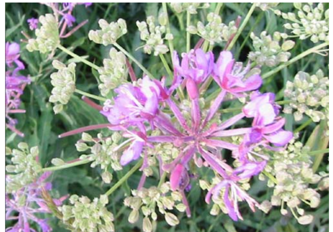
225 pixels per inch, same as a 4 megapixel camera printing an 8x10