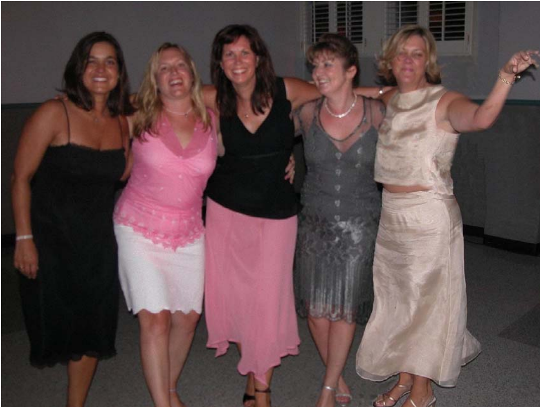
The final result