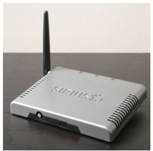
D. Antenna Repeater

Enjoy SIRIUS radio throughout your home without the need to run antenna wires. SIRIUS Echo Signal Repeater system allows you to locate the SIRIUS antenna where it has be best view of the sky, and wirelessly redirect the signal to the rest of the house. Connect the SIRIUS antenna to the Echo transmitter and use one or multiple Echo antennas to receive the signal at the desired locations through-out the house. Broadcasts in the 900mHz band.