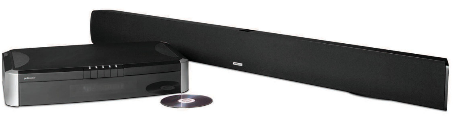
SURROUNDBAR360° DVD THEATER