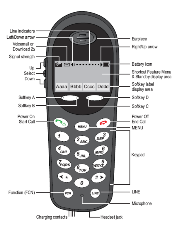
SpectraLink 8002 Wireless Telephone