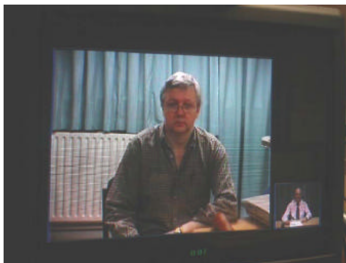
Near end large image, far end small image