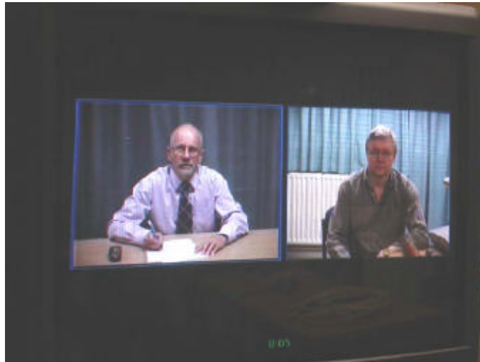
Side by Side equal size images