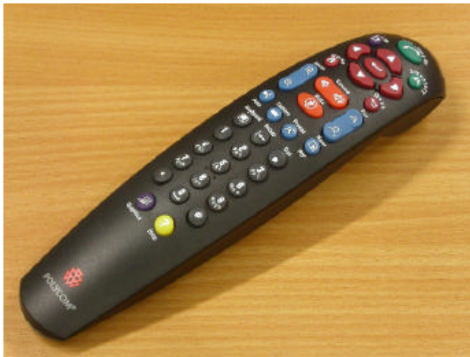
Infrared remote control