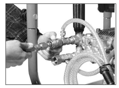
10. Attach high pressure hose to gun.

9. Attach hose reel inlet to high pressure pump.