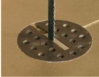
A perforated insert surrounds the blade with dust collection ports.

To help capture dust from above the table we developed a special insert plate with a grid of through holes. This creates a vacuum source surrounding the blade at the table surface to catch much of the dust other bandsaws leave on the surface.