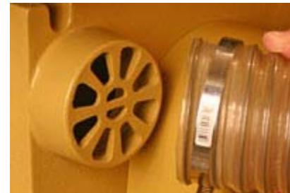
A 4"-diameter port is cast into the lower housing directly below the blade for super-effective dust evacuation.

Rather than routing dust down through the base cabinet we form a port for a 4"-diameter dust hose in the lower cast iron section of the POWERMATIC PWBS-14 Bandsaw. Placing the port where the dust is created greatly improves its effectiveness and eliminates the leaks found in through-the-cabinet systems. That makes even marginal dust collectors perform surprisingly well.