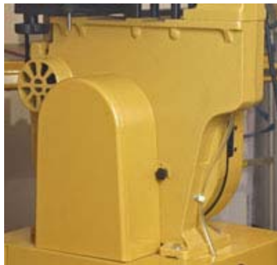
A huge iron casting provides a solid foundation that keeps the PWBS-14 rigid and vibration free.

The POWERMATIC PWBS-14 Bandsaw is built around a pair of huge iron castings that provide an extraordinarily rigid backbone. The lower box-shaped iron casting surrounds the drive wheel and provides a super rigid base on which the rest of the saw is built. The upper casting is equally oversized and designed with flex-fighting rounded corners and an upswept arm that effectively resists the pressures of tensioning \frac{3}{4} "-wide blades properly.