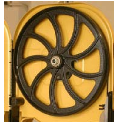
The motor (left) is pre-installed in the enclosed base and sends its power through machined pulleys and an ultra-reliable Poly V-belt. The 9-spoke cast iron drive wheels (right) are fully machined, painted and fitted with tires before being dynamically balanced.

Both cast iron drive wheels are fully machined, painted and fitted with high quality tires and then dynamically balanced to insure smooth operation. The tires have a special crown shape that helps stabilize blade tracking. The drive wheels turn on high-quality ball bearings for a long, smooth running life.