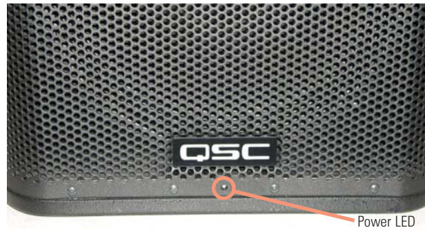
Figure 3. Don't put a screw into the LED hole.