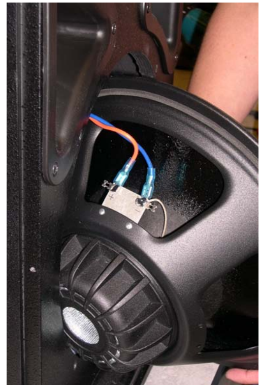
Figure 1. The orange wire connects to the + terminal, and the blue wire to the - terminal.