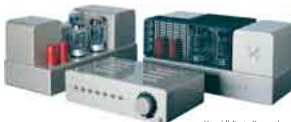
Quad II-Forty Power Amp QC24 Pre Amp