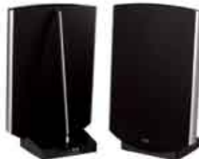
ESL - 2805