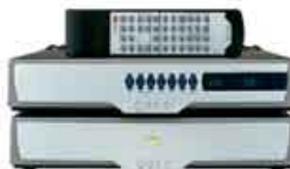
99 - Pre Amp 99 - Power Amp