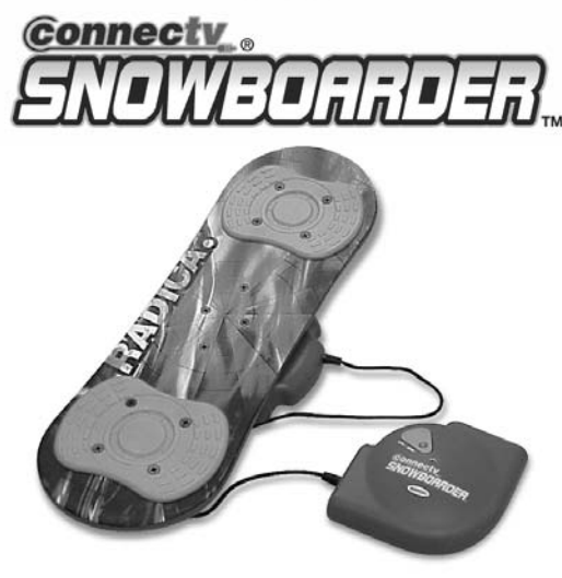
Model 71023uk For 1 player / Ages 8 and up / WEIGHT LIMIT - 180 Pounds / 13 Stone / 80 kilos