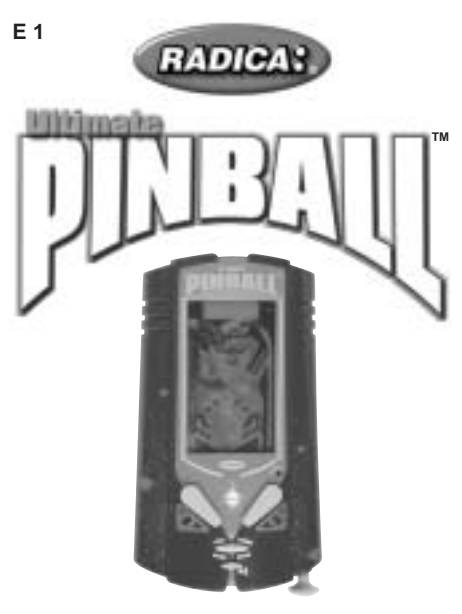
MODEL 73021 1 player / Ages 8 and up