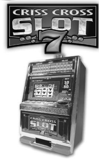
MODEL 73050 For 1 or 2 players / Ages 8 and up