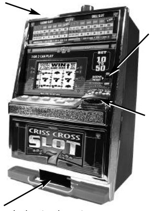
Flip this switch to turn the JACKPOT PAYOUT on/off.