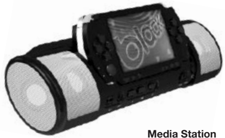
Portable compact design transforms into a multi media system