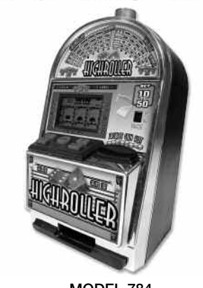
MODEL 784 For 1 or 2 players \ Ages 8 and up INSTRUCTION MANUAL