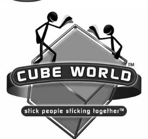
Series 1 15039, 15040, 15096, 15097, 15098 & 15099 For 1 player / Ages 8 and up INSTRUCTION MANUAL P/N 82398320 Rev.E