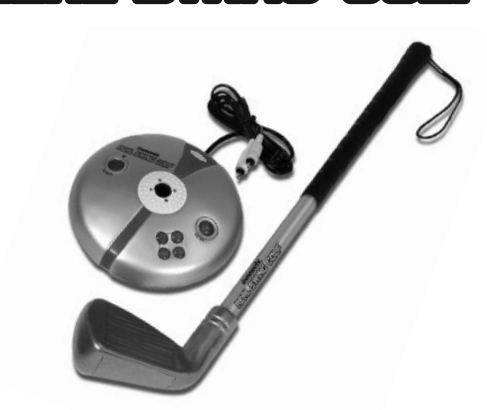
I9037 For 1 to 4 players / Ages 8 and up INSTRUCTION MANUAL P/N 82396410 Rev.D