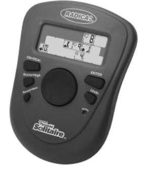
I6006 For 1 player / Ages 8 and up