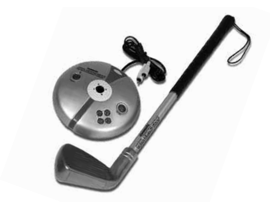
Model 74037 For 1 to 4 players / Ages 8 and up INSTRUCTION MANUAL P/N 82396410 Rev.A