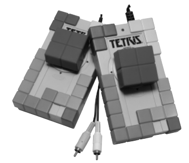
Model 74063 For 1 to 2 players / Ages 8 and up