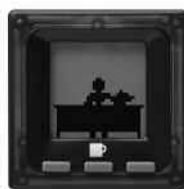
Toner - Paper Pile-up