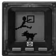
Dash - Package Dash