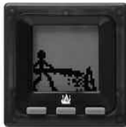
Sparky - Fire Academy

MOTION SENSORS - Play with and pester each STICK MAN™ by shaking or tumbling the cube.