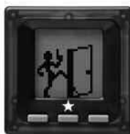
Chief - Police Trainer