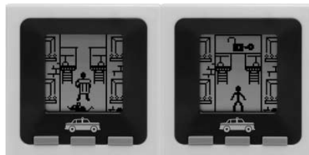
Jump the Rat

UNLOCK ANIMATIONS – During a STICK GAME, a player has the opportunity to UNLOCK a total of 21 ANIMATIONS. This is accomplished by jumping over a rat that runs across the street while a player is catching the items falling from the balcony. To UNLOCK ANIMATIONS, a player must jump over the rat the number of times equal to the ANIMATION they're trying to unlock. For example, if a player has already UNLOCKED 2 ANIMATIONS (2 / 21), they will need to jump the rat 3 more times to UNLOCK the 3rd unique ANIMATION (3 / 21). If it's the 4th ANIMATION, they will need to jump the rat 4 more times (4 / 21). At the end of each game, the total number of UNLOCKED ANIMATIONS will be revealed. Also, an additional 1000 points will be earned for each time the rat is jumped.