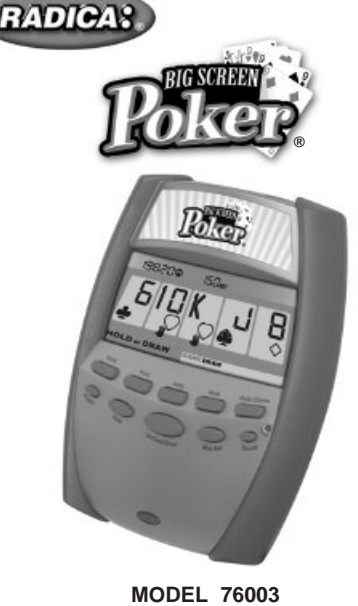
For 1 Player / Ages 8 and up