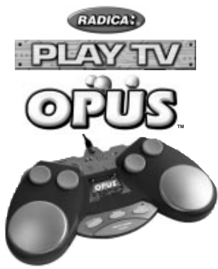
MODEL 8046 P/N 82350100 Rev.A For 1 or 2 players / Ages 8 and Up