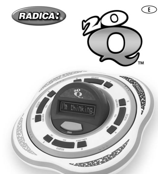
P6624 For up to 4 players / Ages 8 and up INSTRUCTION MANUAL P/N 823D2100 Rev.B

Are you ready for the first multiplayer version of 20Q^{\text{TM}} ? This transformation of the classic handheld game fires up friends and family as you go head-to-head with 20Q^{\text{TM}} and the other players. The first player to outwit 20Q^{\text{TM}} and the other players wins! Sound easy? Guess again.