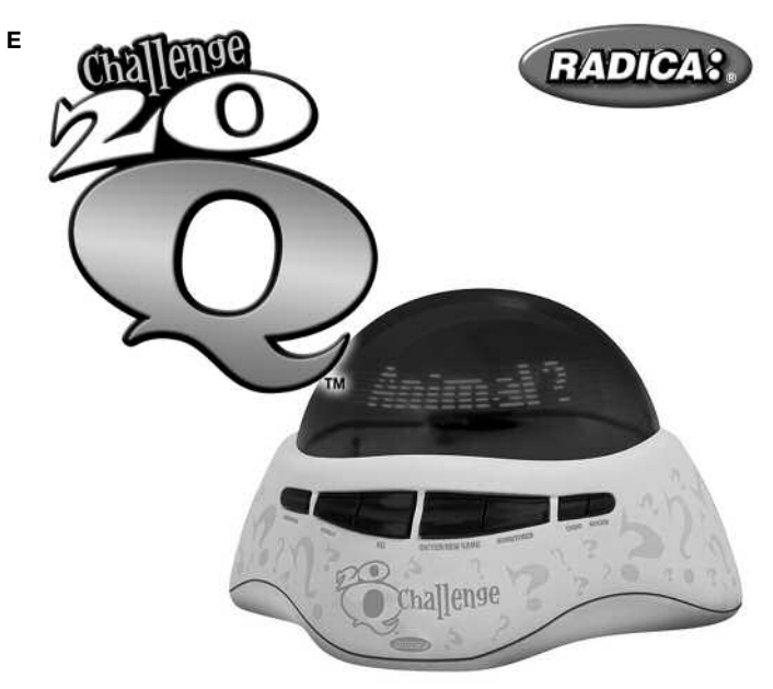
Model 75038 For 1 to multiple players / Ages 8 and up INSTRUCTION MANUAL