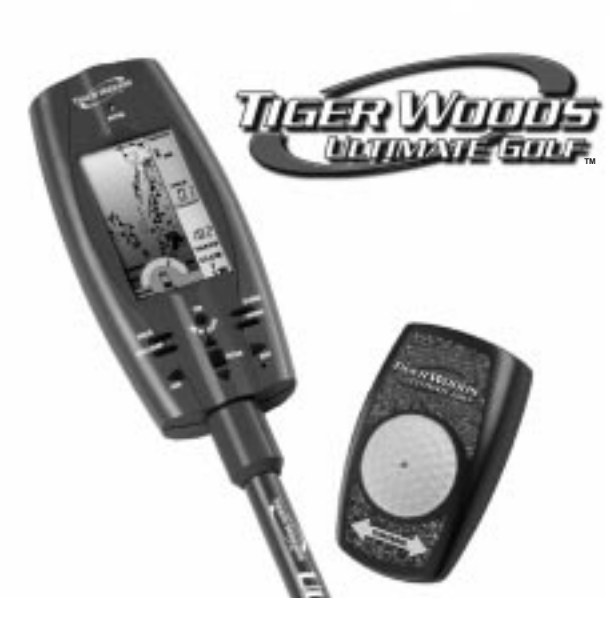
MODEL 9834 • Tiger Woods Ultimate Golf™ For 1 or 2 players / Ages 8 and up P/N 82347700 Rev.A