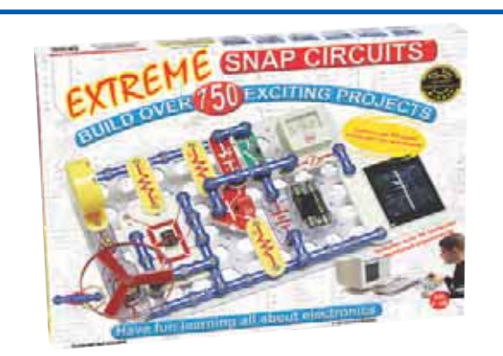
Snap Circuits Extreme Model SC-750 Build over 750 projects, contains over 80 parts, and PC interface included.

ownload from Www Somanuals com. All Manuals Search And Downloa