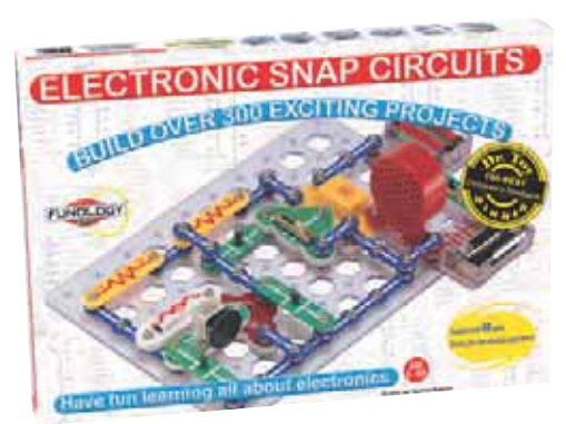
Snap Circuits Model SC-300 Build over 300 projects, contains over 60 parts.