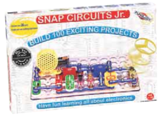
Snap Circuits Jr. Model SC-100 Build over 100 projects, contains over 30 parts.

Contact Elenco® to find out where you can purchase these products.