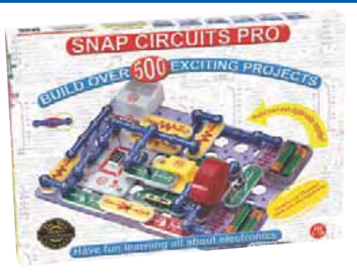
Snap Circuits Pro Model SC-500 Build over 500 projects, contains over 75 parts.