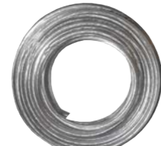
40-ft. 16-gauge Speaker Wire