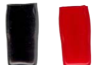
6 Vinyl Insulator Boots (2 black, 2 red large, 2 red small)