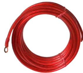
20-ft. 8-gauge Red Power Cable