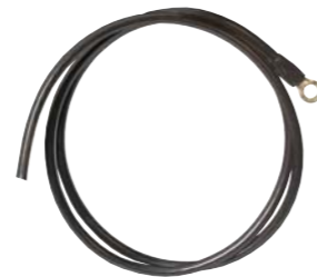
4-ft. 8-gauge Black Ground Cable