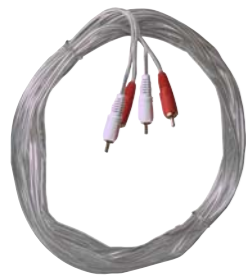
20-ft. Stereo Interconnect Cable