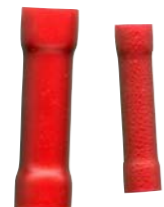
4 Butt Connectors (2 large, 2 small)