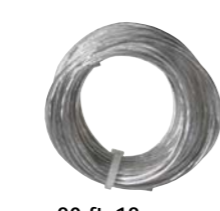
20-ft. 18-gauge Remote Turn-On Cable