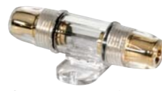
60-Amp AGU Fuse & In-Line Fuse Holder