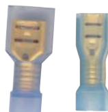
6 Fully Insulated Quick Disconnects for 16-gauge Speaker Wire (3) .205", and (3) .110"