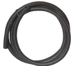
6-ft. Black Split Tubing