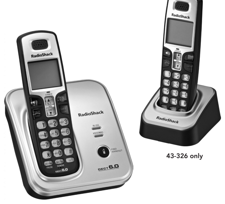
43-325 and 43-326

Thank you for purchasing your new cordless phone from RadioShack . Please read this user's guide before installing, setting up, and using your new phone.