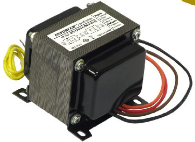
(Model: ST-UV16-W100Q shown)