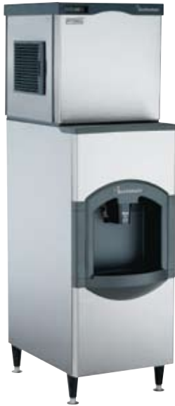
HD22 shown with a Prodigy C0322A cuber