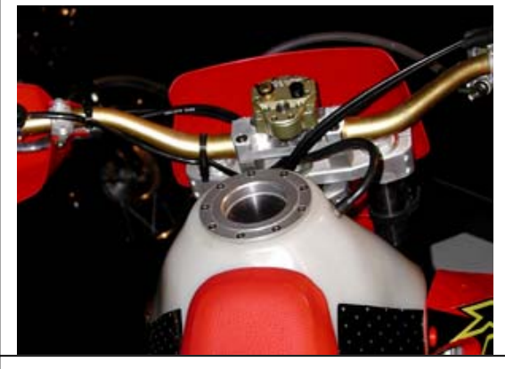
Team Honda Johnny Campbell's Race bike

File the casting flaws both front and rear until smooth, round and allowing the bracket to sit down flush