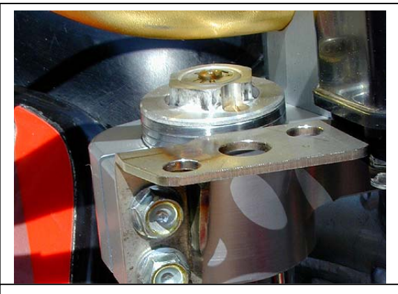
Optional stainless odometer relocation bracket