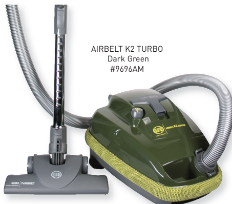
AIRBELT K2 TURBO Dark Green #9696AM