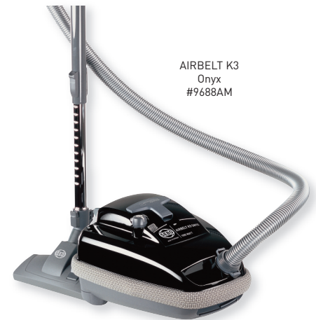
AIRBELT K3 Onyx #9688AM

Flat-to-the-floor, 3½-inch Profile – A low, cleaning-head profile makes reaching under furniture and beds easy!