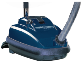
AIRBELT K2 KOMBI Dark Blue #9679AM Includes a Kombi Nozzle #7260GS

Suction Adjustment Switch on Handle – The vacuum’s suction power can be adjusted from 0 to 1,250 watts by a slider switch conveniently located on the handle, providing convenient suction control for normal to more delicate cleaning tasks.