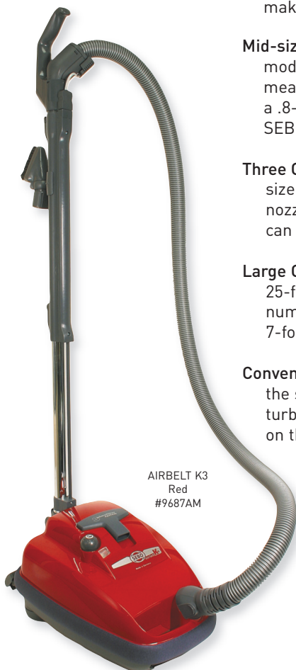
AIRBELT K3 Red #9687AM

Convenient Parking and Storage Aids – After the work is done, the suction hose with telescopic tube and parquet brush, turbo head or Kombi Nozzle can be firmly stored on the canister's underside or backside housing.