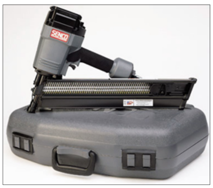
Download from Www.Somanuals.com. All Manuals Search And Download.