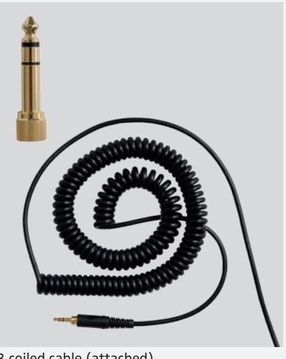
3 coiled cable (attached) 1⁄4" (6.3 mm) jack adapter