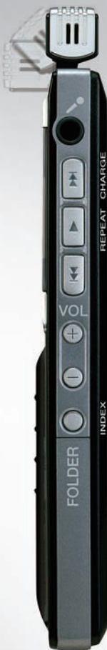
RIGHT SIDE PANEL