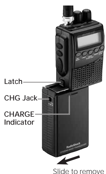
Slide to remove battery pack

To remove the battery pack, slide the battery pack in the arrow direction while holding up the latch.