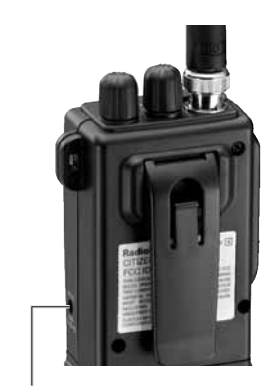
12V DC PWR Jack