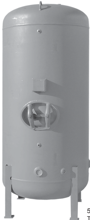
534 Gallon Tank Shown